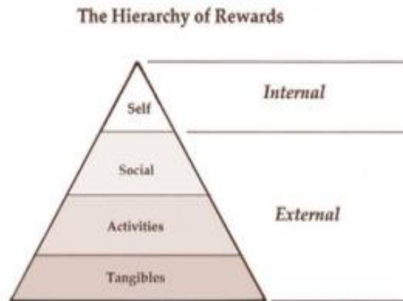
Figure 1. The Hierarchy of Rewards